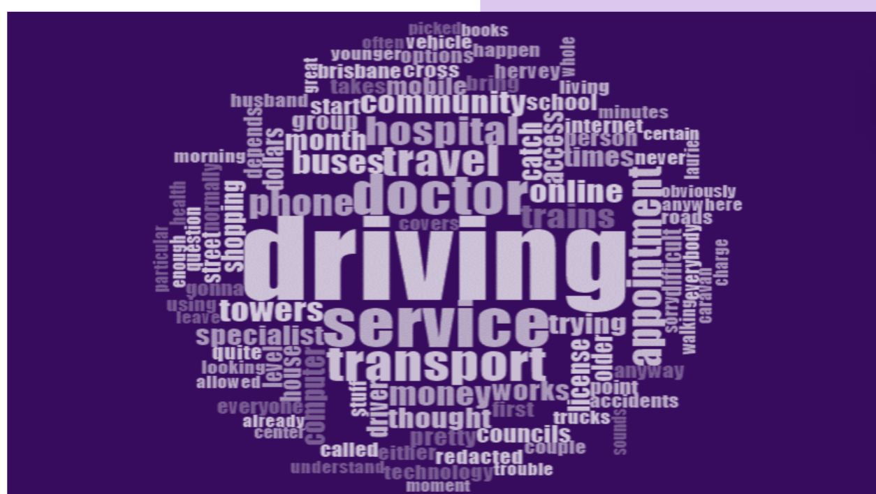
Figure 1. Word Cloud of the most important mobility needs for participants

'I don't know what buses, I don't know when they run'